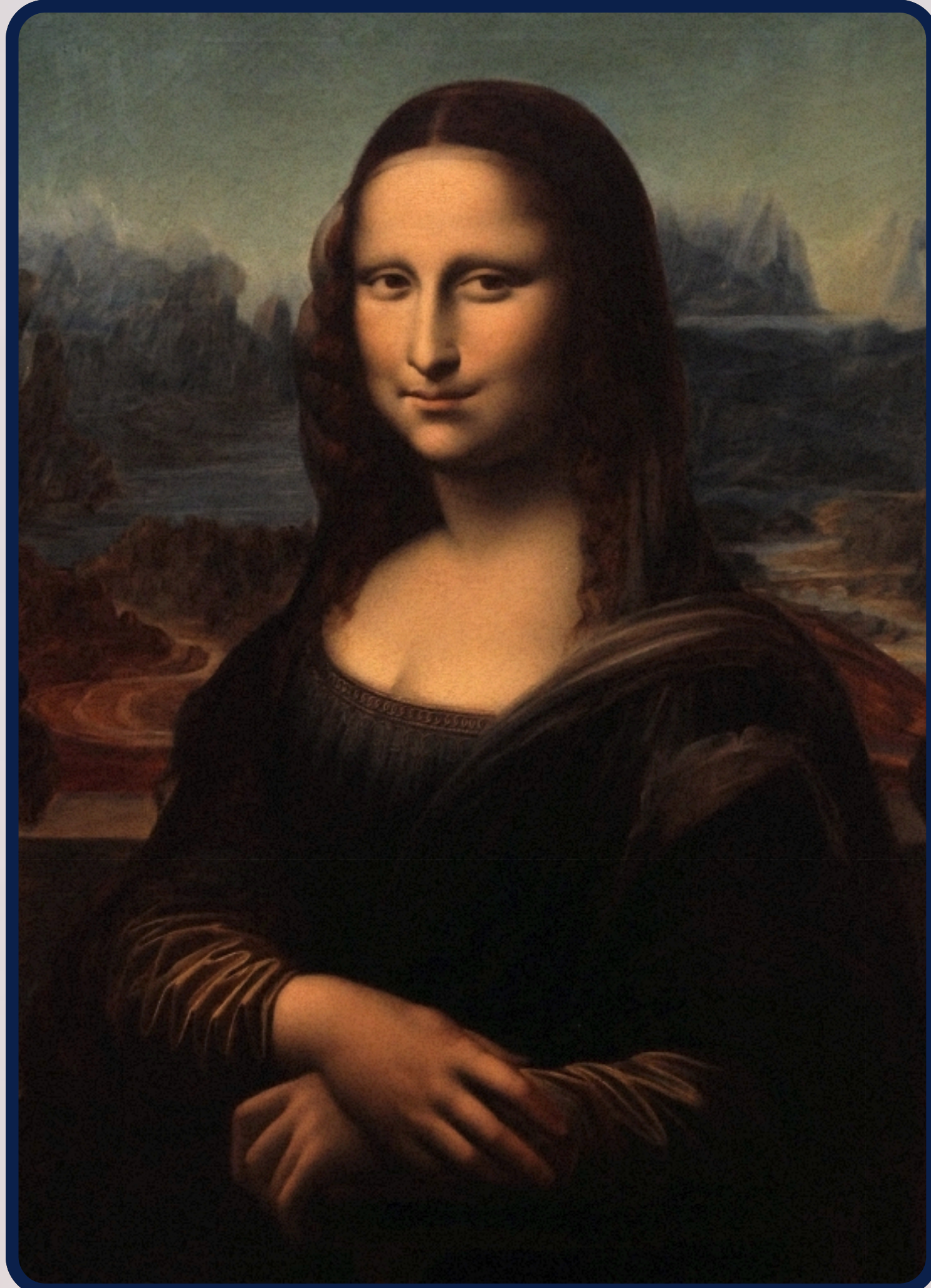
Mona Lisa (1503-06)