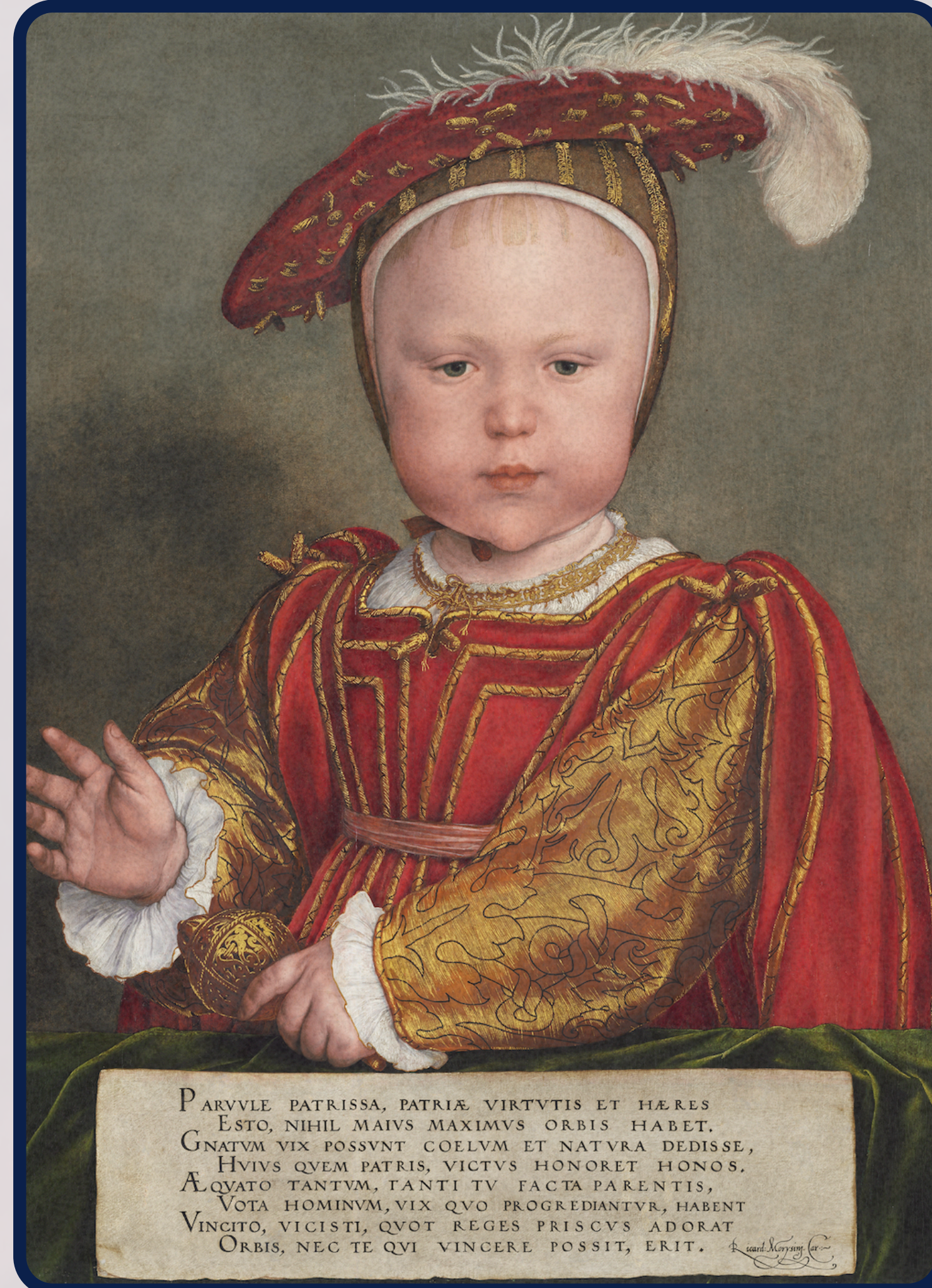
Edward VI as a Child (1538)