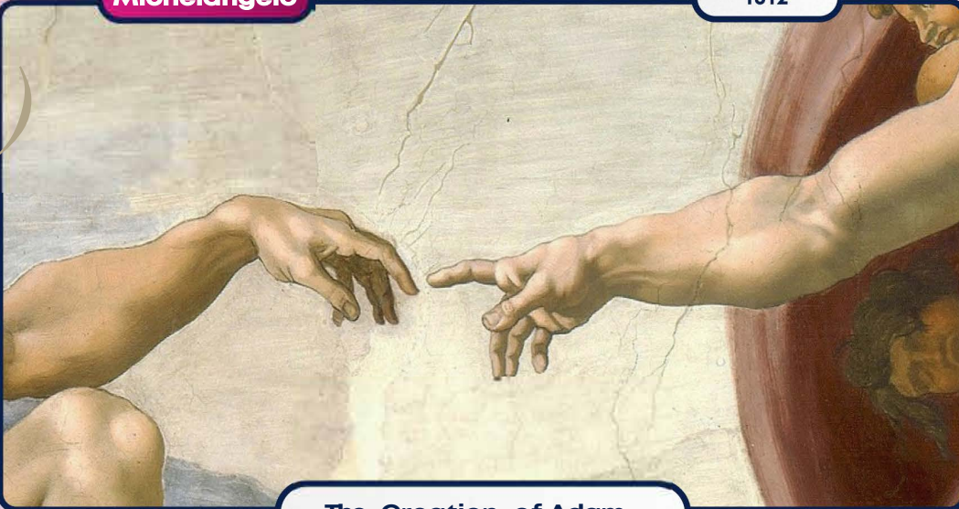
The Creation of Adam